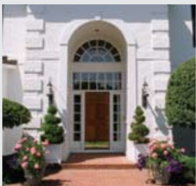
A well-designed entryway welcomes visitors into the home.