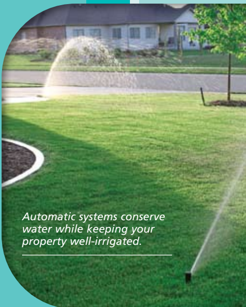
Automatic systems conserve water while keeping your property well-irrigated.

If you're getting tired of dragging the hose around, an automatic irrigation system is an excellent solution! Call Silvis Group today for more information.