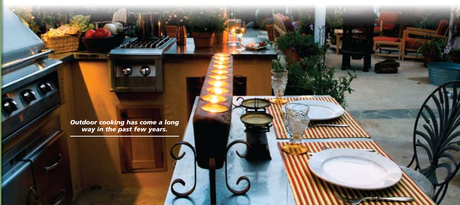
Outdoor cooking has come a long way in the past few years.